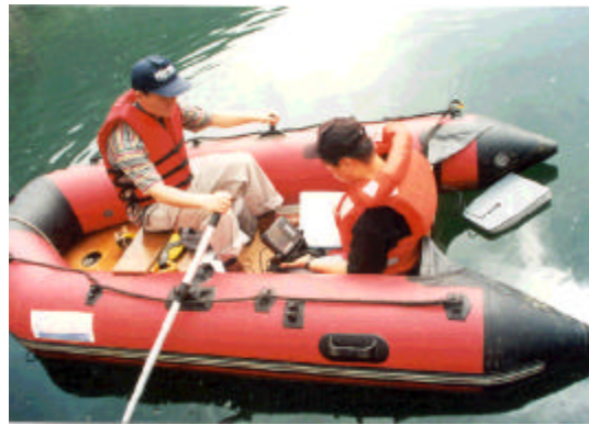
댐체 상류면 부근 바닥표고 측정 현황도